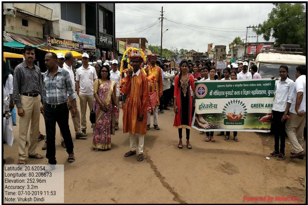
College Green Army Participated in Vruksha Dindi