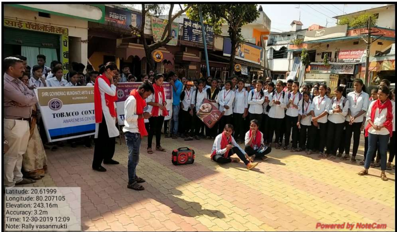
Students performing a street play on de-addiction