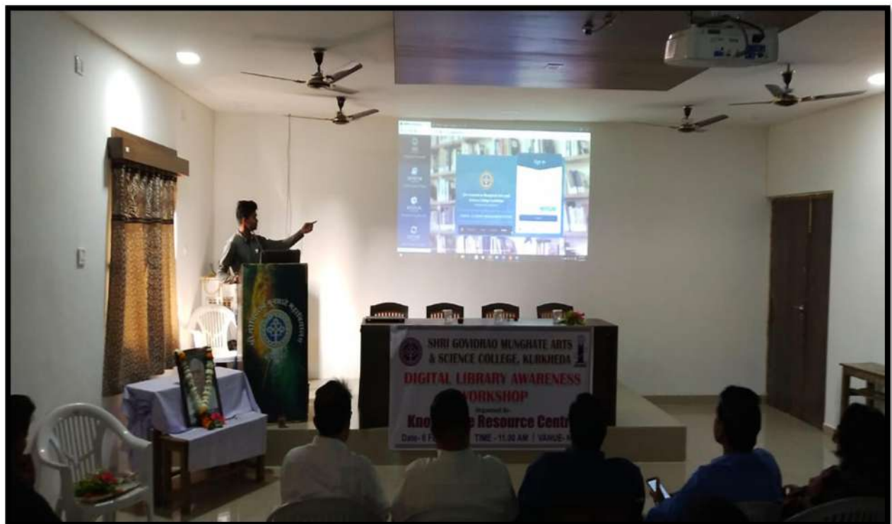
Digital Library Awareness Workshop