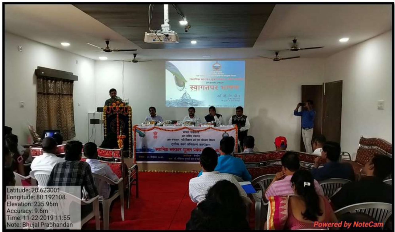
One day Speech on Groundwater Management and Budgeting at the Local Level