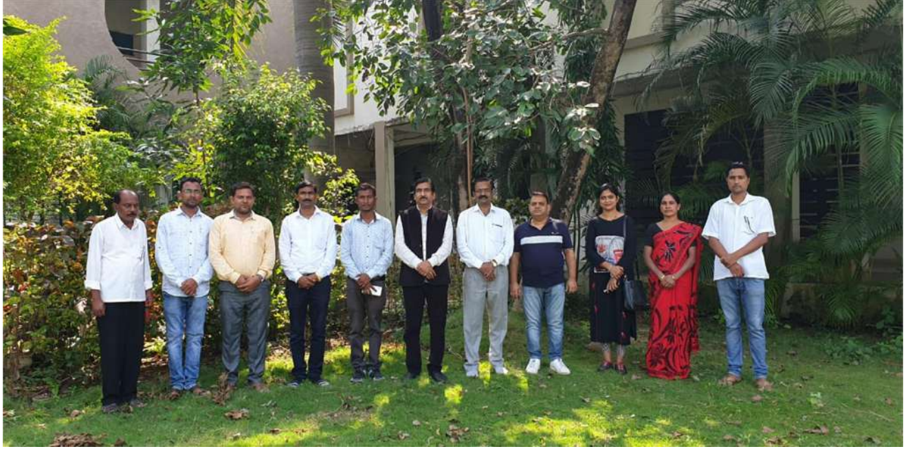
College Conducted Training Programme Under Pradhanmantri Kaushalya Vikas Yojana For Skill Up Gradation Of Students