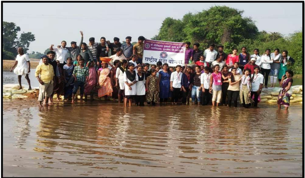
College Adopted Village Nawargovn on Satii River by NSS Students Constructing a Poly Bandara for Water Conservation