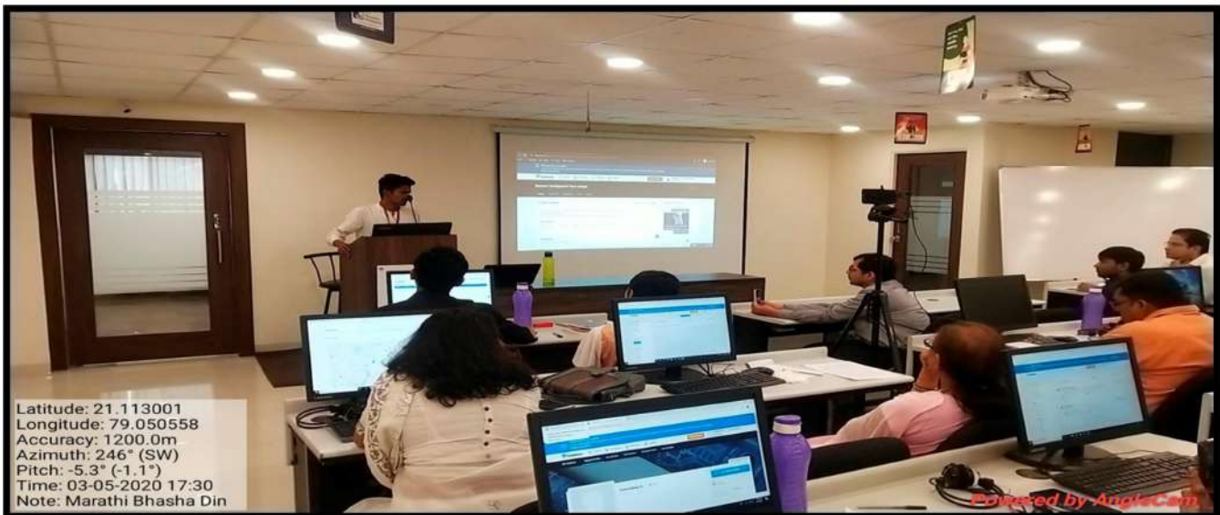
Training Programme on E-Content Development in the age of Freelancer by MKCL