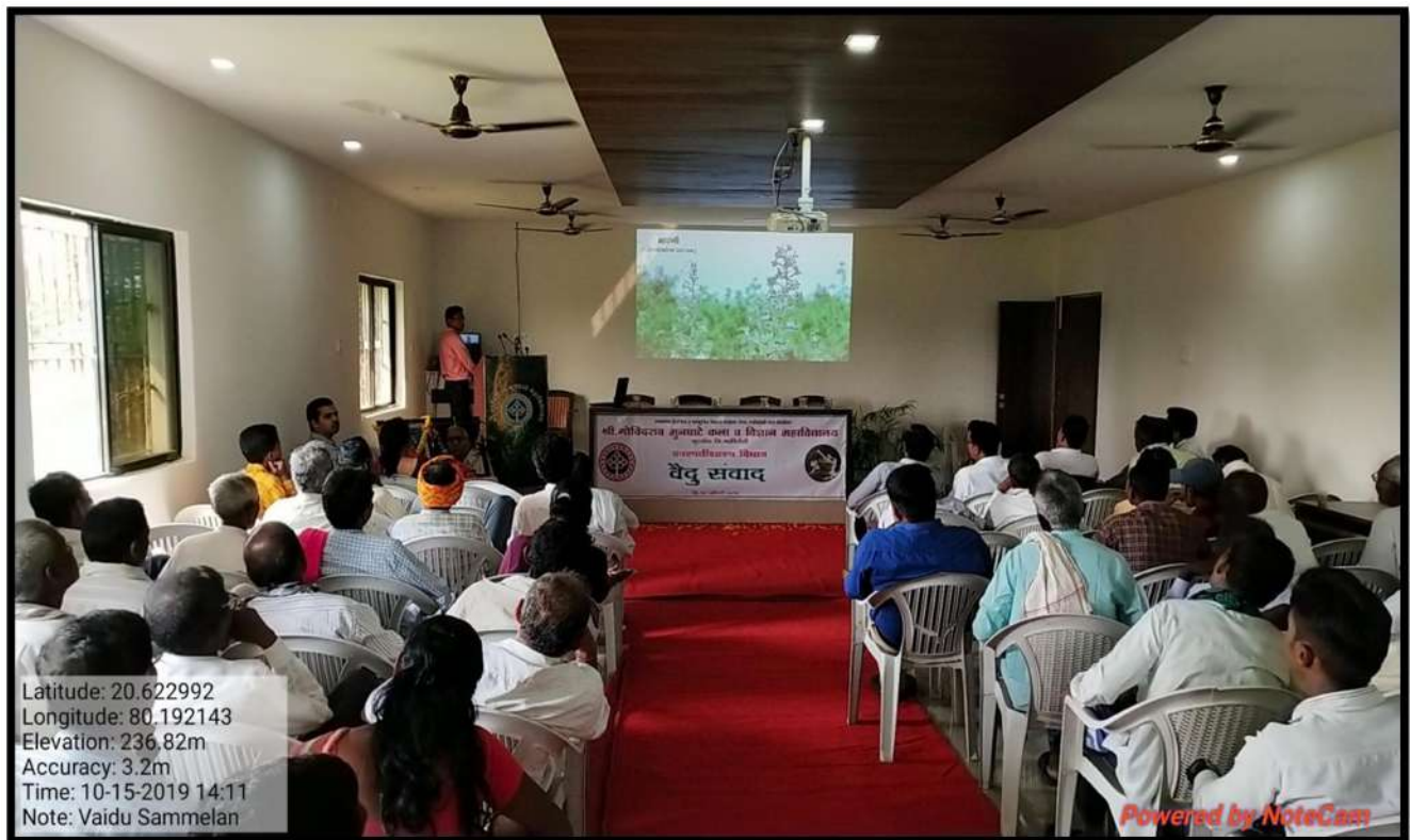
One Day Vaidu Samad Workshop