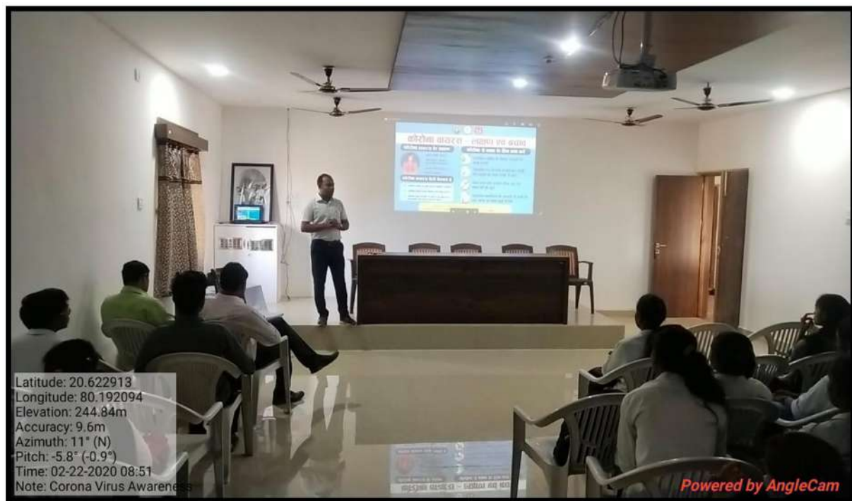
Talk on COVID-19 Prevention