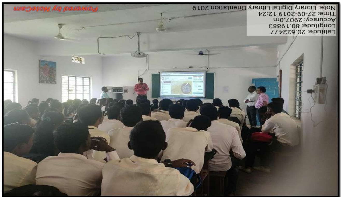
Digital Library Orientation (N-List and NDLI) Session